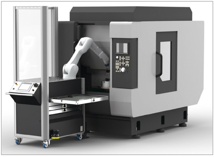
CNC milling center connected to machine front

The space saving solution to increase flexibility and efficiency Price starting at EUR 106.000,— (Without clamping technology)