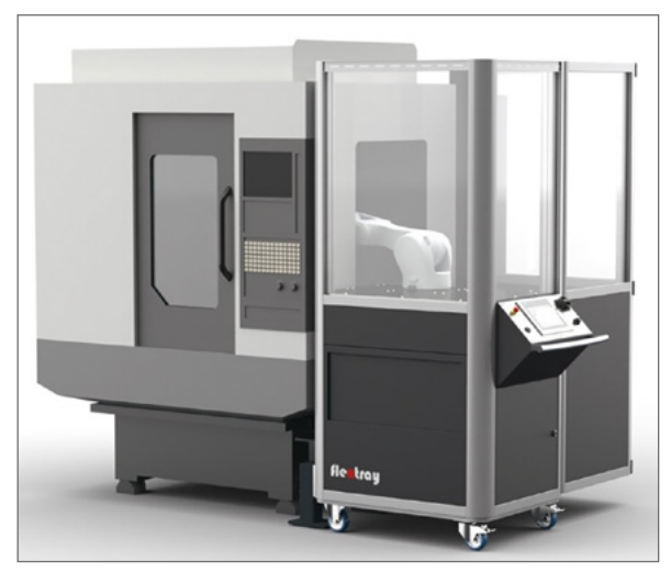
CNC milling center - MRC laterally adapted