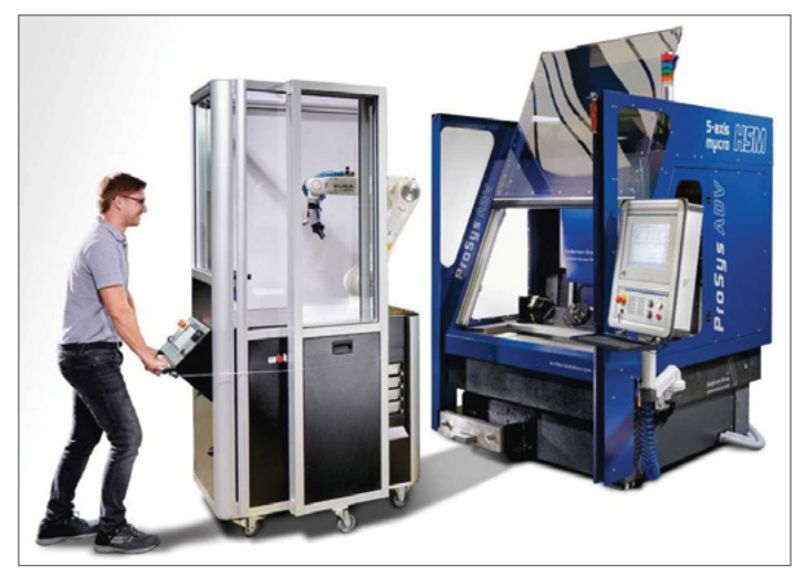
Mobile MRC FLextray Cell docking to machine