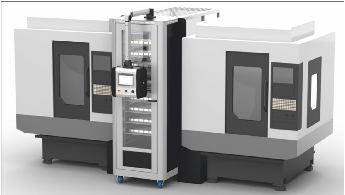
MRC flextower with 2 CNC machines

The space saving solution to increase flexibility and efficiency Price starting at EUR 142.000,— (without clamping technology)