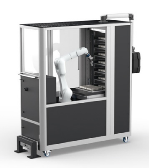
Tray measurements 470 x 300 mm